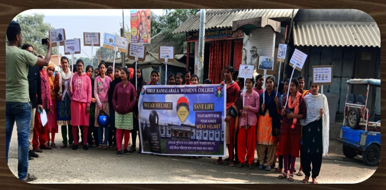
'SAFE DRIVE, SAFE LIFE' AWARENESS PROGRAMME