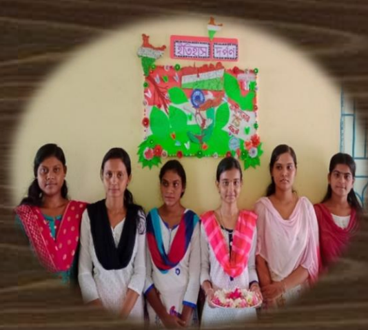
WALL MAGAZINE PUBLICATION CEREMONY