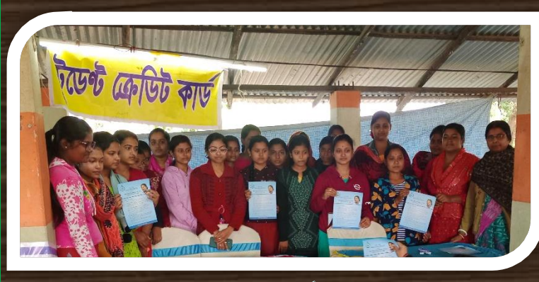
STUDENT CREDIT CARD AWARENESS CAMP