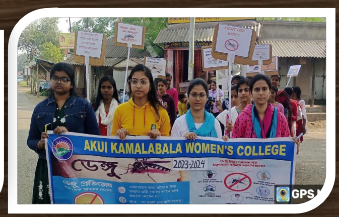
DENGUE AWARENESS PROGRAMME