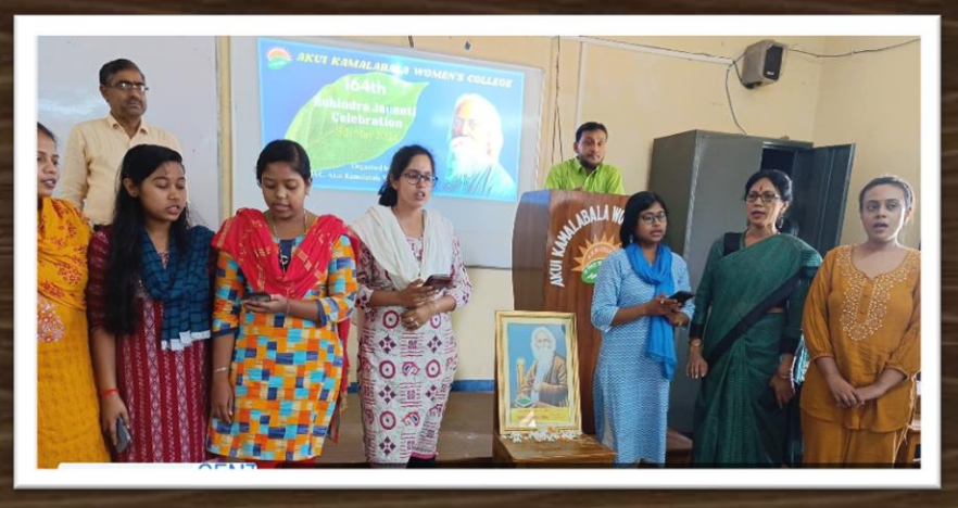
CELEBRATION OF RABINDRA JAYANTI