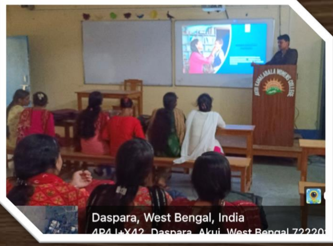
GENDER AWARENESS PROGRAMME